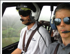
Language kickoff up North