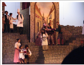
High School Play