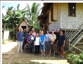
Palawan Ministry Team