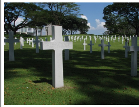
All Saints Day