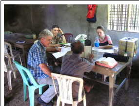
Palawano Bible Check