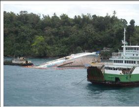
Sunken Ferry in Mindoro