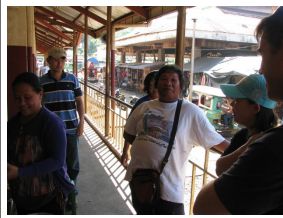
Market Language Mindanao