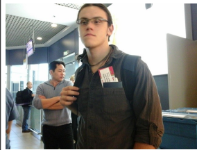
Airport in Moscow