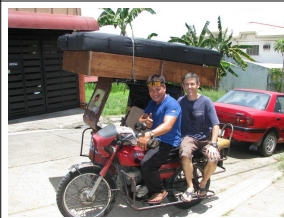
Moving to New House