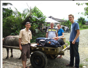
Visiting Palawan Ministries