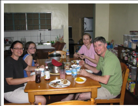
Friends from Texas