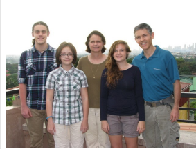
Home Together Again