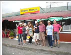
Mindoro Tribal Visit