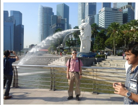
Layover in Singapore on the way to the Philippines