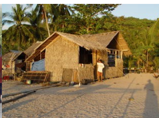
These are sea people living on the beach