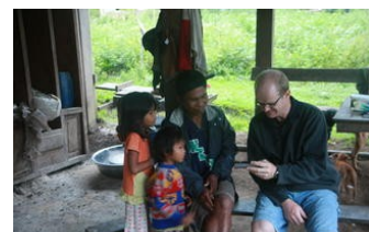
Visiting at someone's house in a Northern tribe