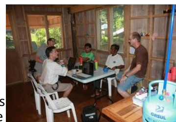
On a consultation check in another tribe