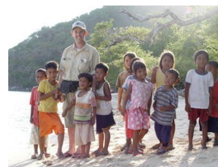
This was the island I visited 5 years ago

Here are some pictures from our consultant trip to the 3 tribes!