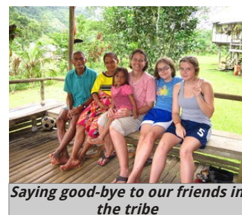
Saying good-bye to our friends in the tribe