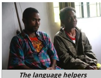
The language helpers

Allow me to just relate one story of our time last week when we visited one of our missionaries working in a language group in Northern Luzon. After walking with him around the village, we brought his language helpers over to do "communication tasks." One of these was to compare and contrast the differences between a pig and a water buffalo in the tribal language. First we had the missionary describe the differences, which we recorded, and then we had the language helper translate into Tagalog for us and at the same time critique the missionary's native language skills. In this case, the missionary did very well and the language helpers told us that he described everything just as they would say it.