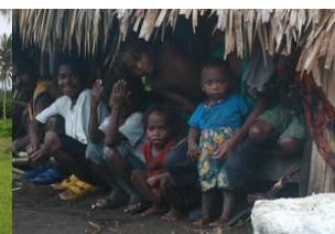
Agta people in a native home.