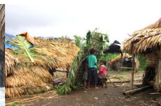
An Agta village