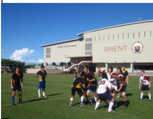
Rugby season started again this fall.