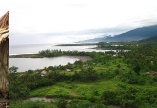
The Agta live on a beautiful black sand beach