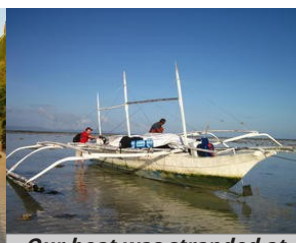
Our boat was stranded at low tide when we needed to leave