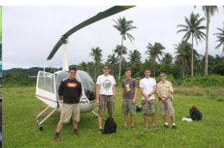
Our helicopter going to the tribes and our team