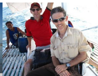
Traveling over the open ocean on a bangka