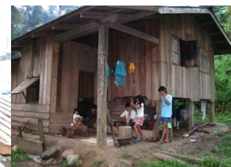
Ga-dang mountain people pounding rice for breakfast